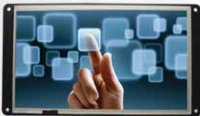
Multi-Layer Touch Screens (7", 10.1", 11.6", 15.6" & 18.5" screens)