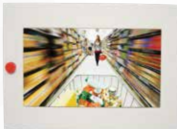
Clegg POP Paper Wrap Video Players (2.4", 4.3" & 7" screens... Custom Shape Wraps)