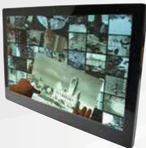
Android Capacitive Touch Screen Players (7", 10.1", 13.3", 15.6", 18.5" & 21.5" screens)