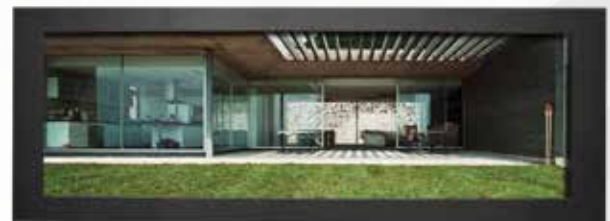
14.9" Extra Wide High Definition Media Player