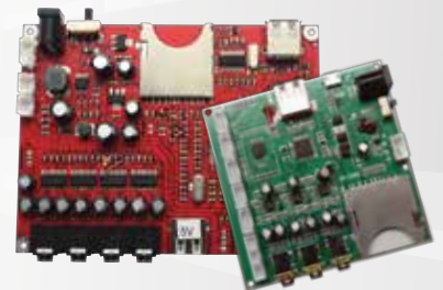
Clegg Premium and Economy MP3 AudioPlayers (4 Channel Premium and 3 Output Economy Players)