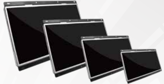
High Definition Media Players (7, 10.1, 11.6, 13.3, 15.6, 18.5, 21.5, 24 & 32" screens)